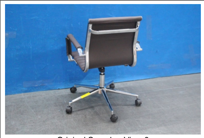
Original Sample - View 3